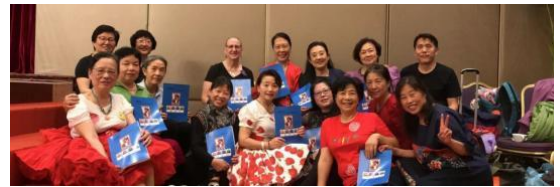
4, 109 squares demonstration in April 2021

Square dance activity is a good way to learn English, and English learning helps our square dance. Every morning we read English in our wechat group online. By this way we are together, whatever where we are