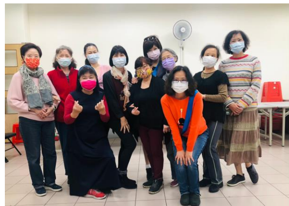
Fig.2 SDAROC initiates the second CallerTraining Camp, supposedly be held from March to June, 2021, is terminated by the pandemic outbreak.

One week after Mother’s Day gathering, to our great surprise, locally acquired cases of COVID-19 soared rapidly. The Level 3 Pandemic Alert was subsequently imposed by the government. While tracking down the route of transmission, the society began to realize that mask-wearing and civil obedience was not a 100% guarantee for immunity. Working from home or taking online courses made people craving for ordinary activities and starting to demand for a full vaccination. Knowing that no sufficient amount of vaccine doses were secured at that time made people frustrated and furious. Thanks to Japan, USA, Lithuania, Czech, Poland, and Slovakia that generously offered immediate vaccine donation to us. Our anxiety lessened eventually as more and more vaccine doses arrived and the vaccination rate keep rising.