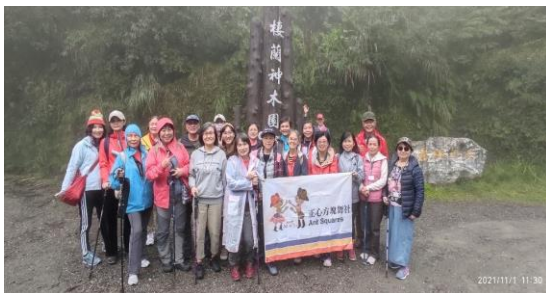
Fig 4. Ant Squares Club celebrates its 22nd Anniversary in a two-day tour, where they hike during daytime and dance at night, right after the travel restriction lifted.